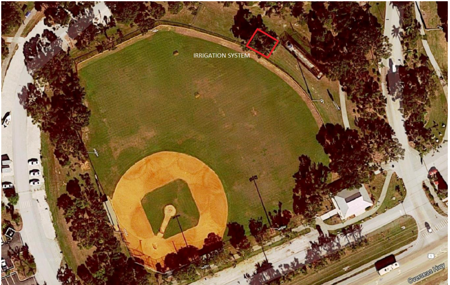
Figure 2: Diagram showing existing field layout and irrigation system location